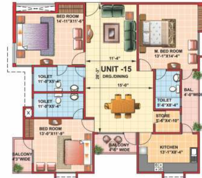
UNIT PLAN - 15 (TYPE-E 3BR) SUPER BUILTUP AREA 1860 SQ.FT.