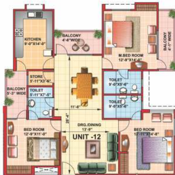
UNIT PLAN - 12 (TYPE-E 3BR) SUPER BUILTUP AREA 1860 SQ.FT.