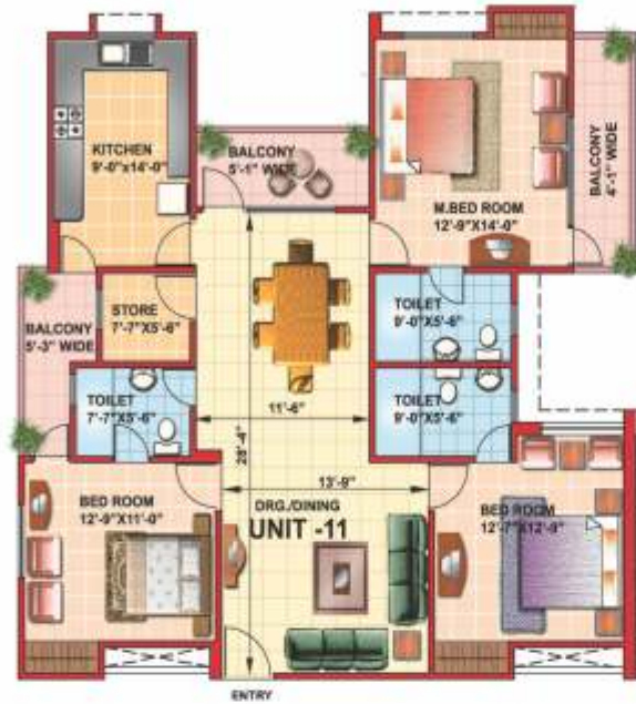
UNIT PLAN - 11 (TYPE-E 3BR) SUPER BUILTUP AREA 1860 SQ.FT.