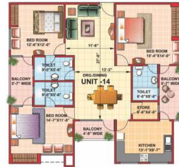
UNIT PLAN - 14 (TYPE-E 3BR) SUPER BUILTUP AREA 1860 SQ.FT.